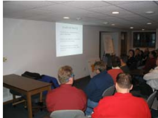
Public Open House Meeting

For each community, ordinances were prepared to address complex land use issues such as: new zoning districts, home occupations, open space preservation, clustering, accessory structures, landscaping, parking, noise and nuisance standards, lighting, shoreland, ATV use, regulation of gravel mining and others.