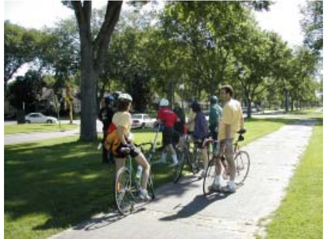
Public Bike Tour

The plan was designed consistent with the Bikeway Master Plan and Grand Rounds Scenic Byway Plan and is a basis for construction plans and a tool to obtain Federal Highway funding.