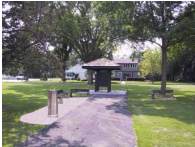
VICTORY MEMORIAL PARKWAY MASTER PLAN - MEMORIAL REST STOP