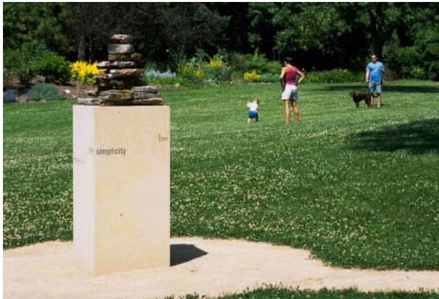
One of the seven cairns marking the Pathway to Peace in Lake Harriet Park, Minneapolis, MN