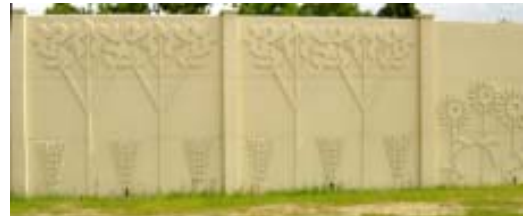
I-94 Soundwall Gateway Design, Fargo, ND