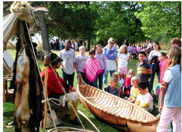
The park is the site of River Rendezvous, a annual week-long event drawing over 10,000 visitors.