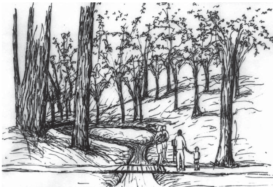
Sketch of the pond and stream through the site. Note the interpretive sign near the trail.