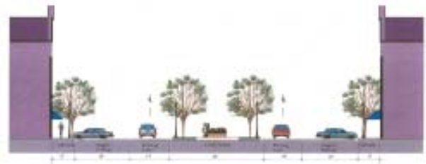
Conceptual section for Park Commons main drive